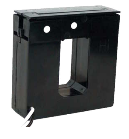
REGULATORY AGENCY APPROVALS