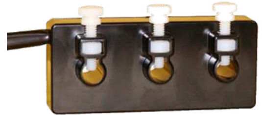
For Horizontal Mounting

* Consult factory for additional ratios.