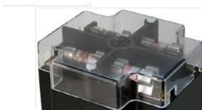
Clear Plastic Cover