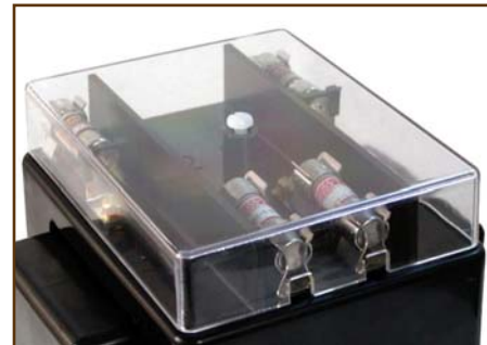
Clear Plastic Cover

Retro Fit Fuse Kit Order No. 0222 PL 7019