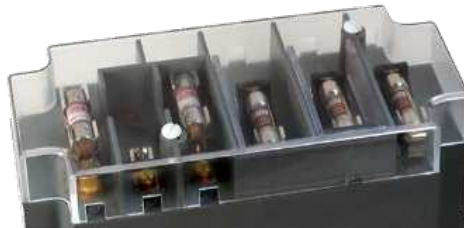
Clear Plastic Cover