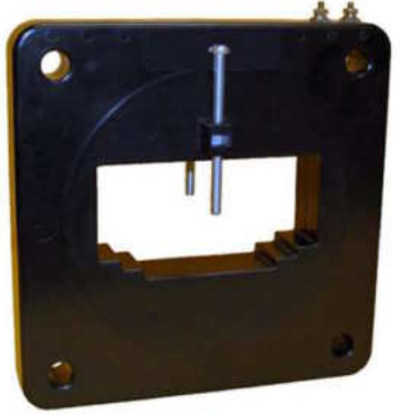
Shown with Bus Bar Mounting Kit